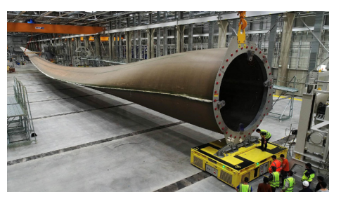
Photograph of a wind turbine blade.

With the need to reduce CO<sub>2</sub> emissions, the use of renewable energy sources, e.g. wind power, is highly important in the fight against climate change. LM Wind Power produces every 5<sup>th</sup> of the wind turbine blades in the world. An important process in the manufacturing is blade casting where a liquid resin diffuses into bundles of glass and carbon fibres. The process is controlled by the resin flow and by keeping the network fibre bundles under vacuum. LM Wind Power entered a collaboration with the 3D Imaging Centre at DTU through LINX, a project funded by the Innovation Foundation in Denmark, in order to better understand the blade casting process on a micrometer scale. With X-ray micro Computed Tomography (CT), the resin flow front was analysed to reveal the process of resin diffusion into fibre bundles.